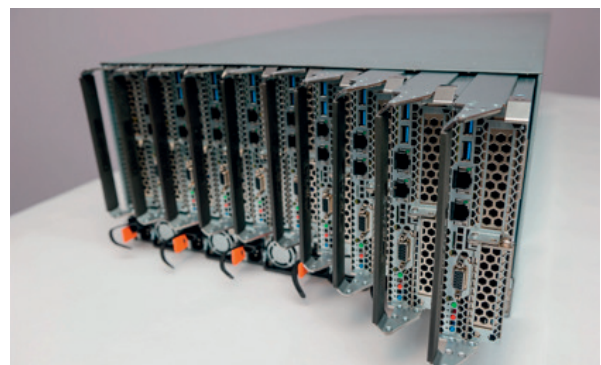
View of the T-Platforms V5050 chassis. Each chassis can host ten V210S or, alternatively, five GPU-equipped V210F blades.