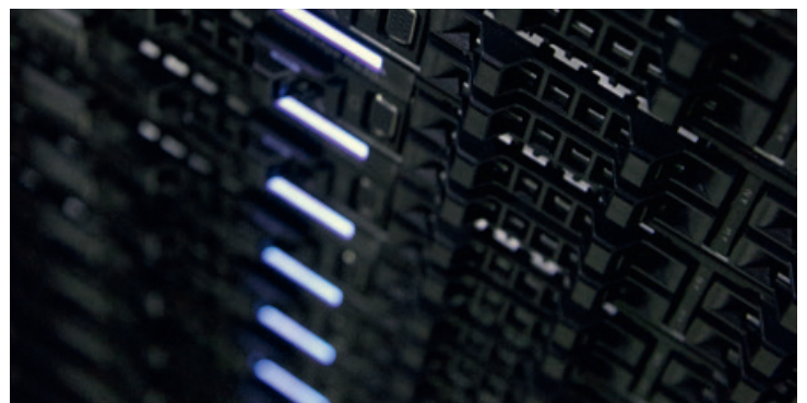
View of the Dell R630 server providing cross-module connectivity.