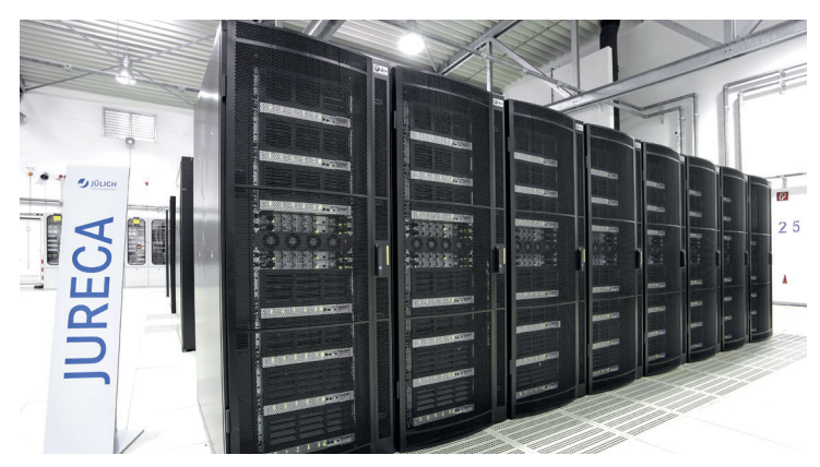
JURECA Cluster module