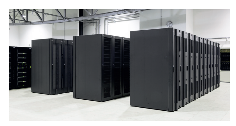
JURECA Booster module

Contact: p.thoernig@fz-juelich.de, d.krause@fz-juelich.de | Website: www.fz-juelich.de/ias/jsc/jureca