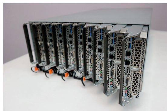
View of the T-Platforms V5050 chassis. Each chassis can host ten V210S or, alternatively, five GPU-equipped V210F blades.